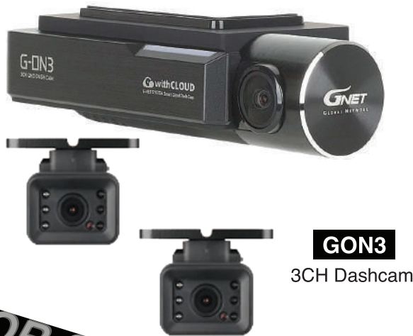
GON3 3CH Dashcam