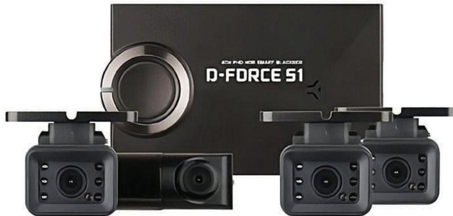
D-FORCE 4CH HDR Smart DVR