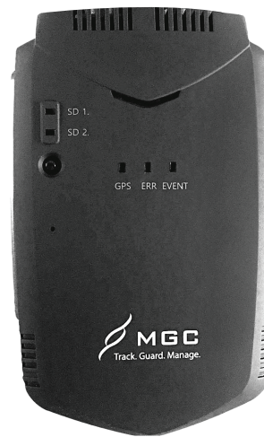
MDR3000 Single View Dashcam