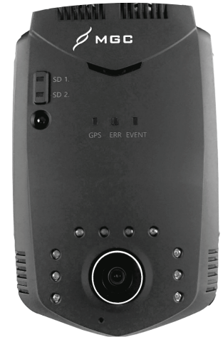
MDR5000 Dual View Dashcam